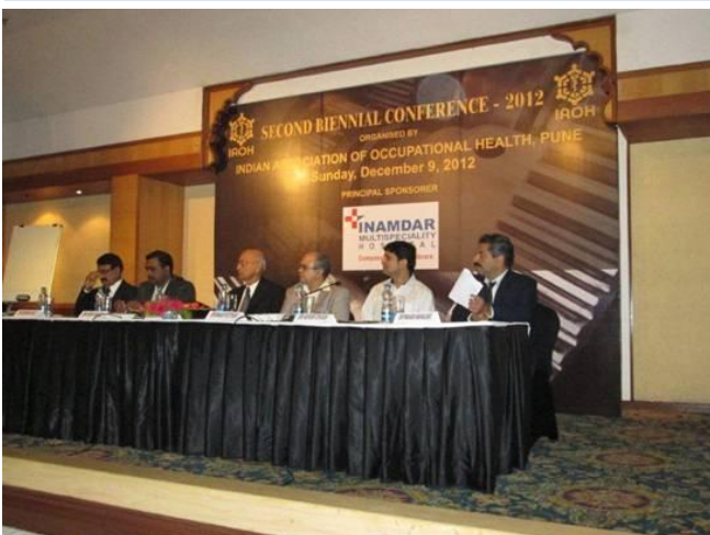
Inauguration ceremony: “Second Biennial conference 2012” at Hotel le Meridien