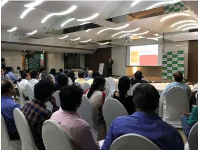
Caption: Photo 3: Delegates engrossed in session at CME jointly held by IAOH Mumbai Branch and SL Raheja Hospital on 23 rd Sep 2017.