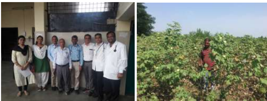
Caption: Photo 4: IAOH Mumbai Branch Team after interacting with Doctors from Govt Medical College , Yavatmal